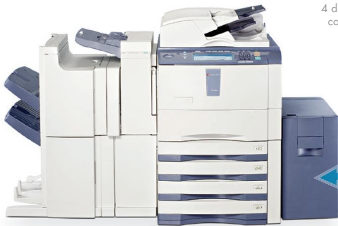
4 drawer paper configuration