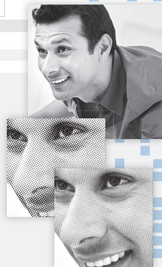
Superior image quality.

Speed is only valuable when the product remains high-quality. That's why Toshiba ensures image quality with a crisp, clear 2400 x 600 dpi using an advanced image processor unit. Ultra-fine 8-micron toner and 40-micron developer also help keep images crisp, offering exceptionally fine resolution. An 8-bit monochrome scanner produces precise grayscales while sharpening onscreen images.