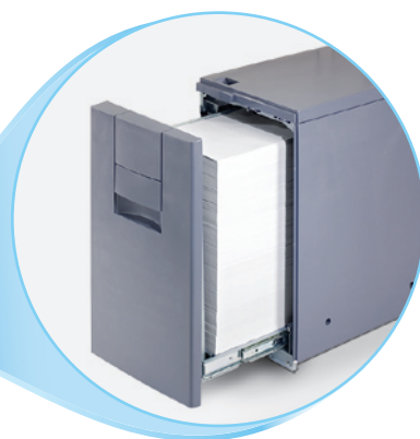
4,000-Sheet Large Capacity Feeder